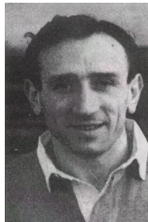
Ken Jones OBE